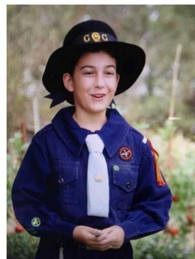
Further Back In Time For Dinner 1923 The 1920s