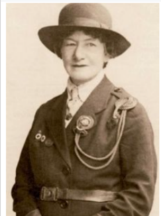
Portrait of Agnes Baden-Powell

Born Agnes Smyth Baden-Powell 16 December 1858 Paddington, London, United Kingdom