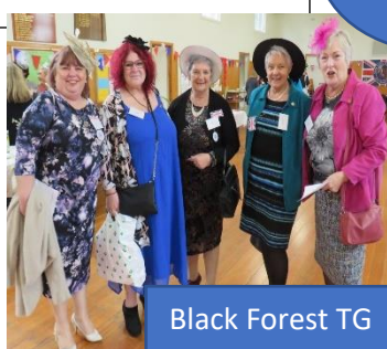
Black Forest TG