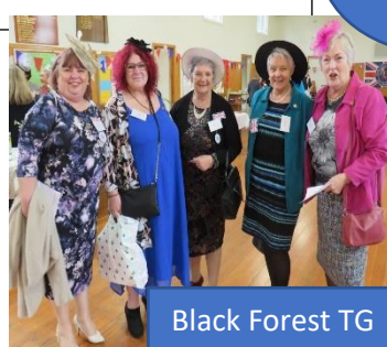
Black Forest TG