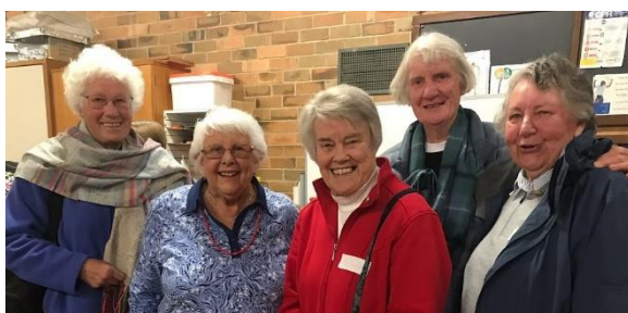
Look at these happy ladies - they have completed their CSCF session!

A big thank you to all those who have supplied the information for their Police Checks. I'll be back to you soon with a better resolution re: Working With Children's Checks.